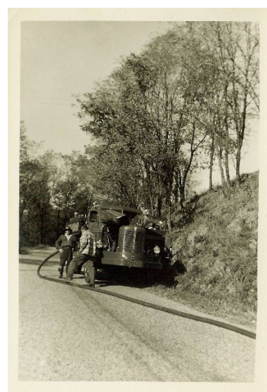
York New Salem Fire Co.