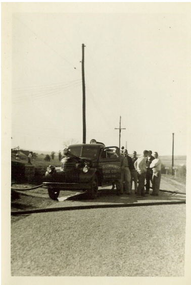
Bair Community Fire Co.

In this case, I think I may know where these came from, but I'm not 100% sure. These were all together, and I think they were from either a fire incident, or from a training evolution. I'm leaning towards a relay pumping exercise. Either way, they're a great look back at some classic fire apparatus!