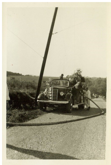
Jefferson Fire Co.