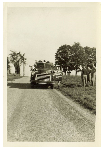
Porters Community Fire Co.