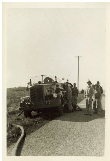
Seven Valleys Fire Co.